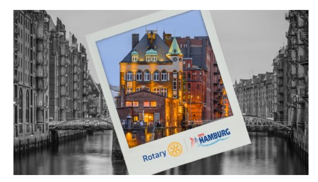
1-5 June 2019 HAMBURG, GERMANY